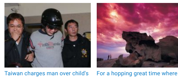
Taiwan charges man over child's beheading